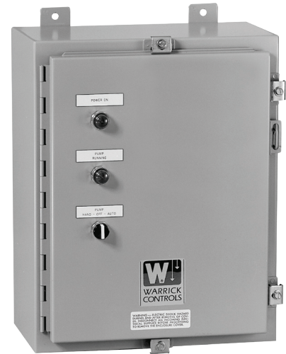
Single-function standard panel