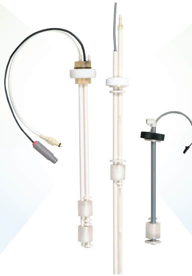
LS-350 MULTI-POINT LEVEL SWITCH