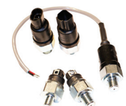
PS61 Subminiature Pressure Switches