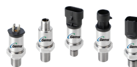
3100 and 3600 Compact Pressure Transmitters & Solid State Switches